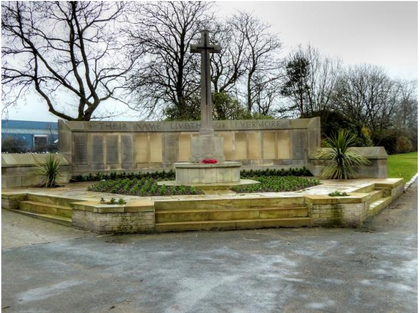
Burnley Cemetery War Memorial

The War Memorial in Burnley Cemetery stands close to the Rossendale Road entrance. Created in 1924, it includes a screen wall which records the names of 174 servicemen buried in the cemetery between 1914 and 1924. The memorial also incorporates a Commonwealth War Graves Commission Cross of Sacrifice. The cemetery also contains 93 scattered burials of the Second World War.