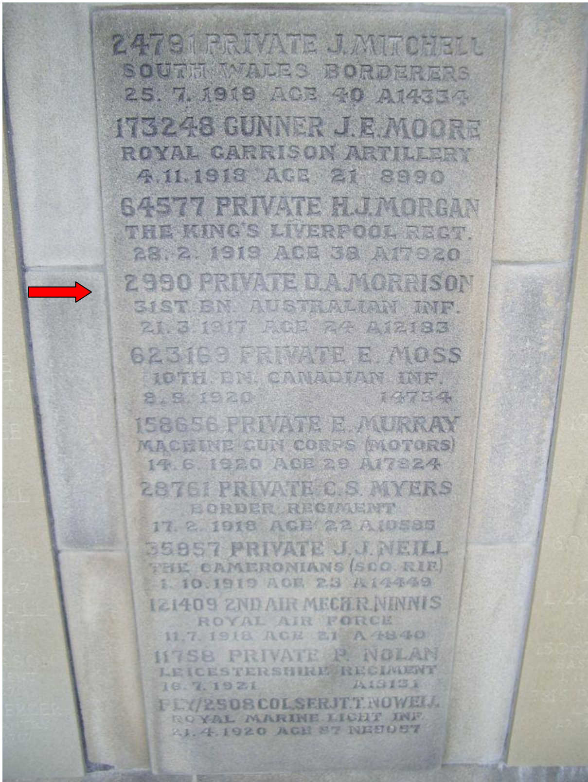
Section of Screen Wall in Burnley Cemetery showing Private D. A. Morrison